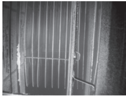
Superheat pendants in 700MW power boiler burning PRB coal