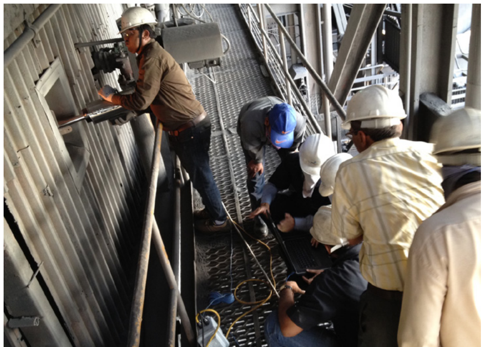
Right: BoilerSpection MB system demonstration