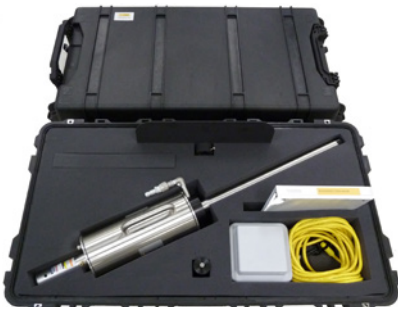
BoilerSpection MB in the included storage and travel case